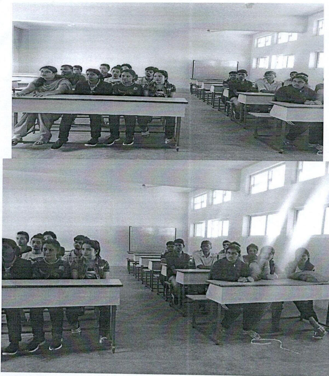
Students attending NET coaching session