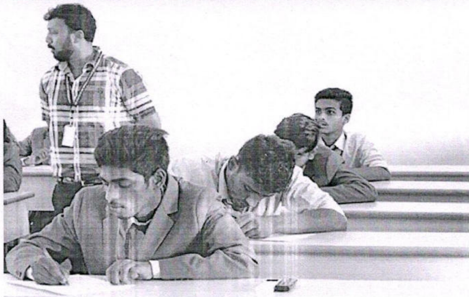
Students are participating in the Diary Entry activity conducted by Chaucer's Academy on 14th February 2019.