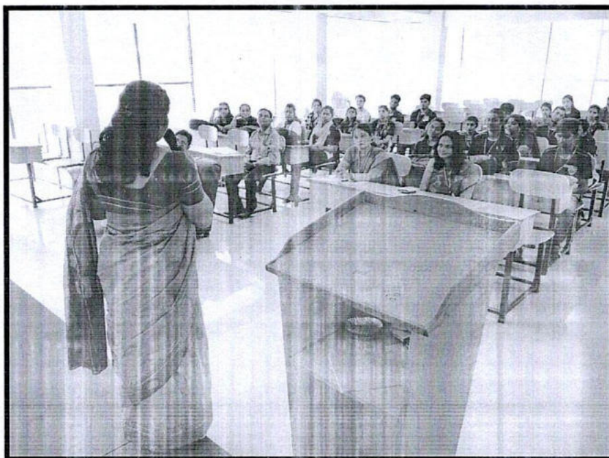
A view of the invited talk