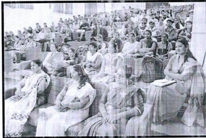
A view of audience during a session