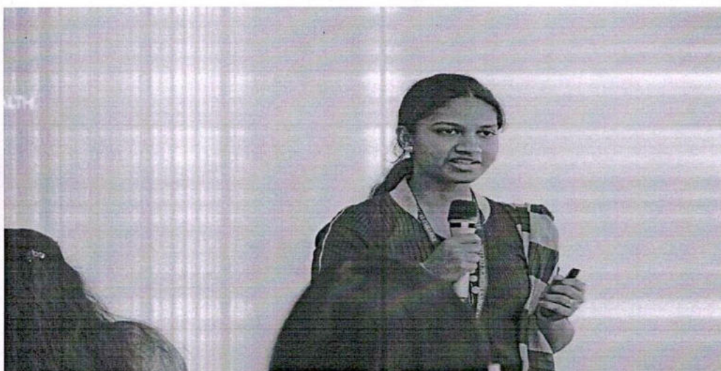
Resource person addressing the queries of students

A freelance counsellor, he is having many years of experience under the career development and professional counselling. He conducted various training and coaching sessions for students. He helped many professionals for develop their career and achieve career growth.