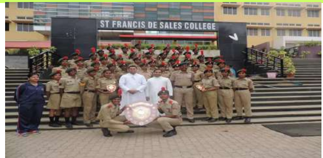
NCC CAMP IN JALAHALLI ATTENDED BY DESALITES