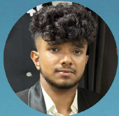
AMOSLENSTEN BBA "B" 3rd sem