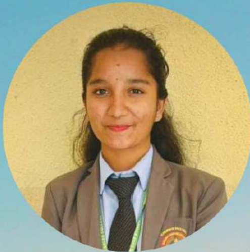
Varuna M III year